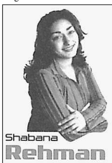
Fig. 2. The photo of Shabana Rehman that accompanies her regular column in Dagbladet .

Symbolic power relations. Different arenas generate different intellectual and political agendas. The strategy of the columnist-activist is to attract maximum attention within a minimum of time, through a well orchestrated and